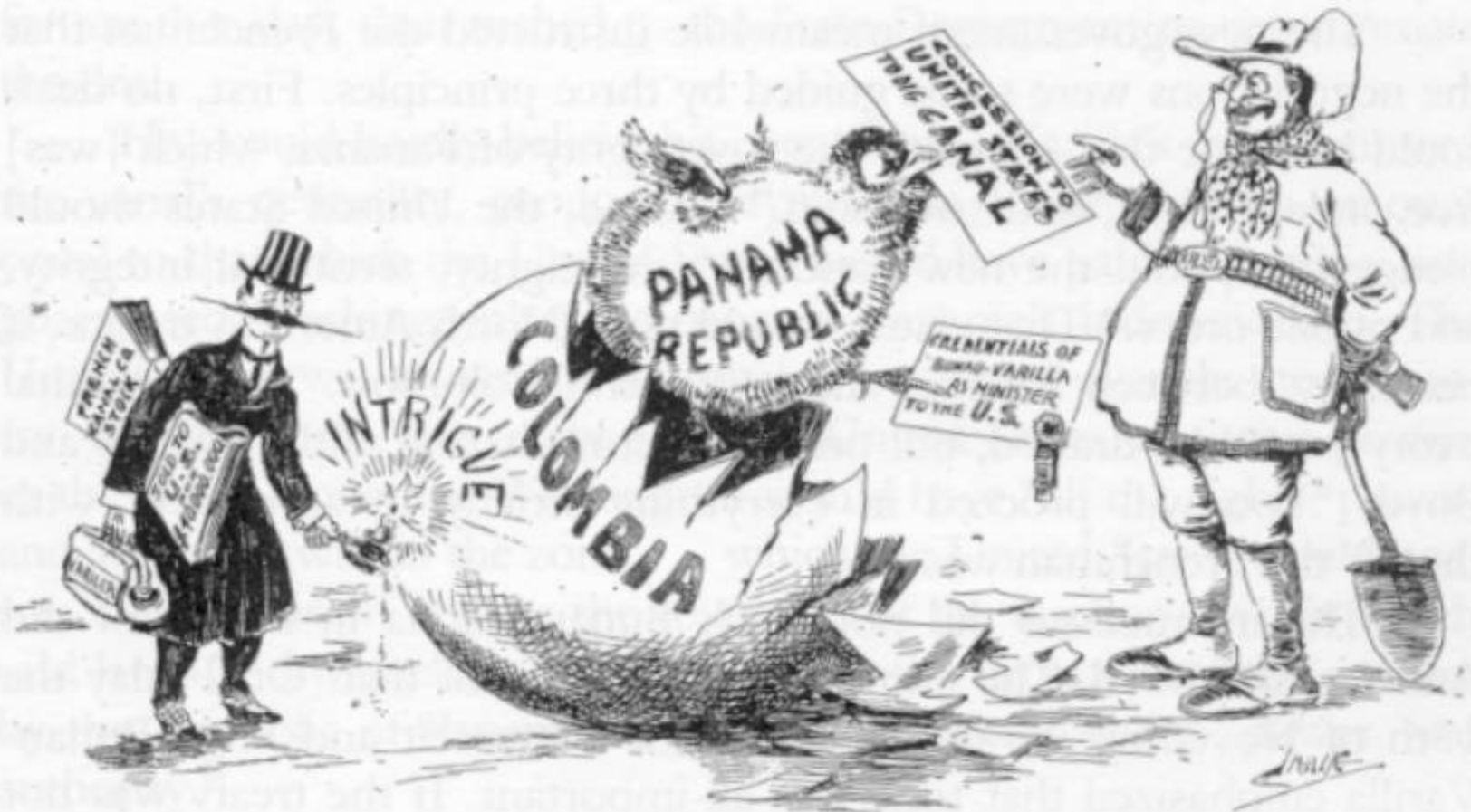
THE MAN BEHIND THE EGG.

“The Man Behind the Egg,” 1903. This contemporary cartoon suggested that conspiracy lay behind the delivery of the Panama Canal Zone to the United States. ( New York Times , November 15, 1903)