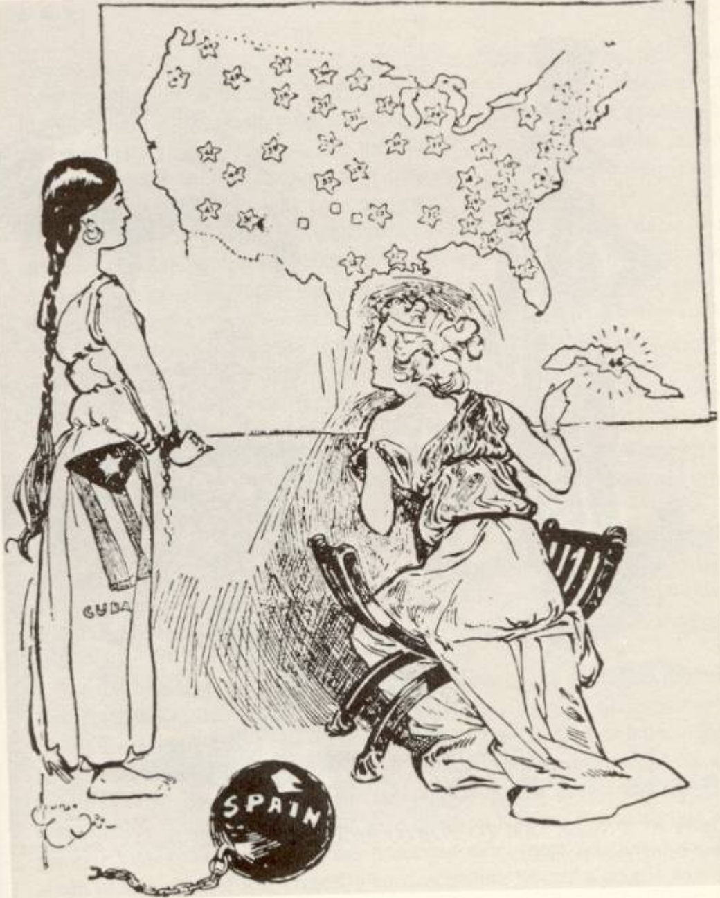
Figure 9. Miss Cuba Receives an Invitation MISS COLUMBIA (to her fair neighbor): "Won't you join the stars and be my forty-sixth?"

Following Spain's defeat, Cuba was pictured by annexationists in the U.S. as a "fair neighbor" as opposed to dangerous and delinquent, like Puerto Rico was in the next cartoon.