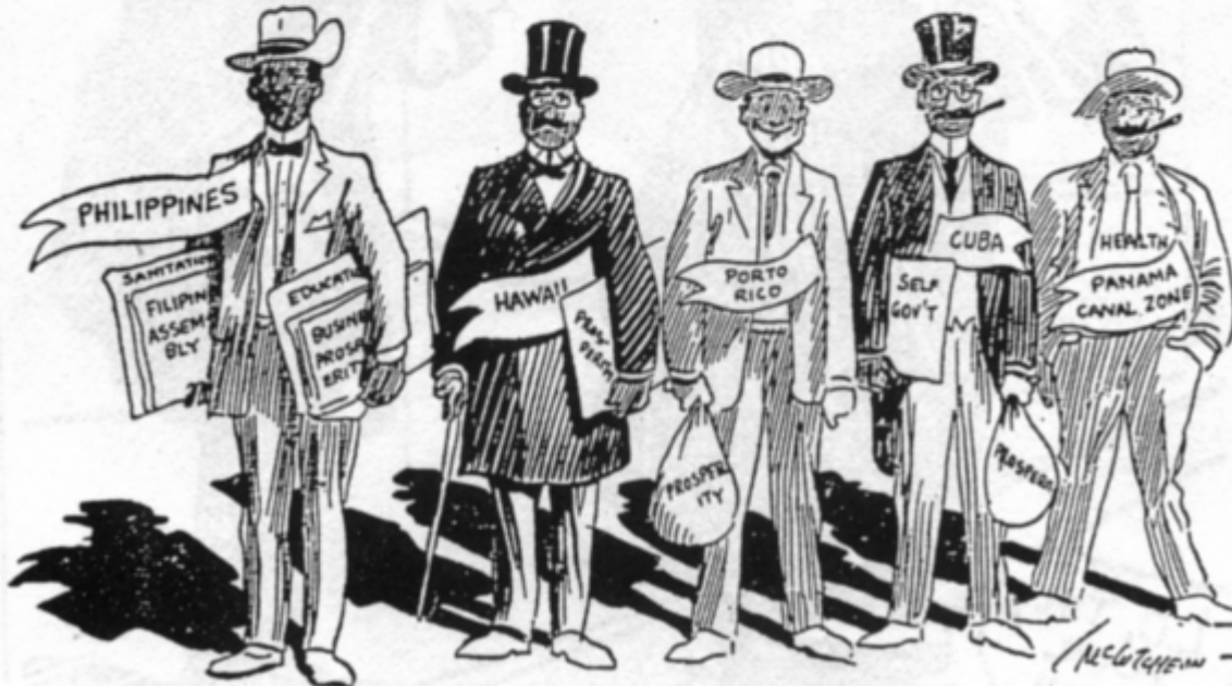
After the United States had rescued them from their oppression.

Before the US Intervened in behalf of these oppressed people.