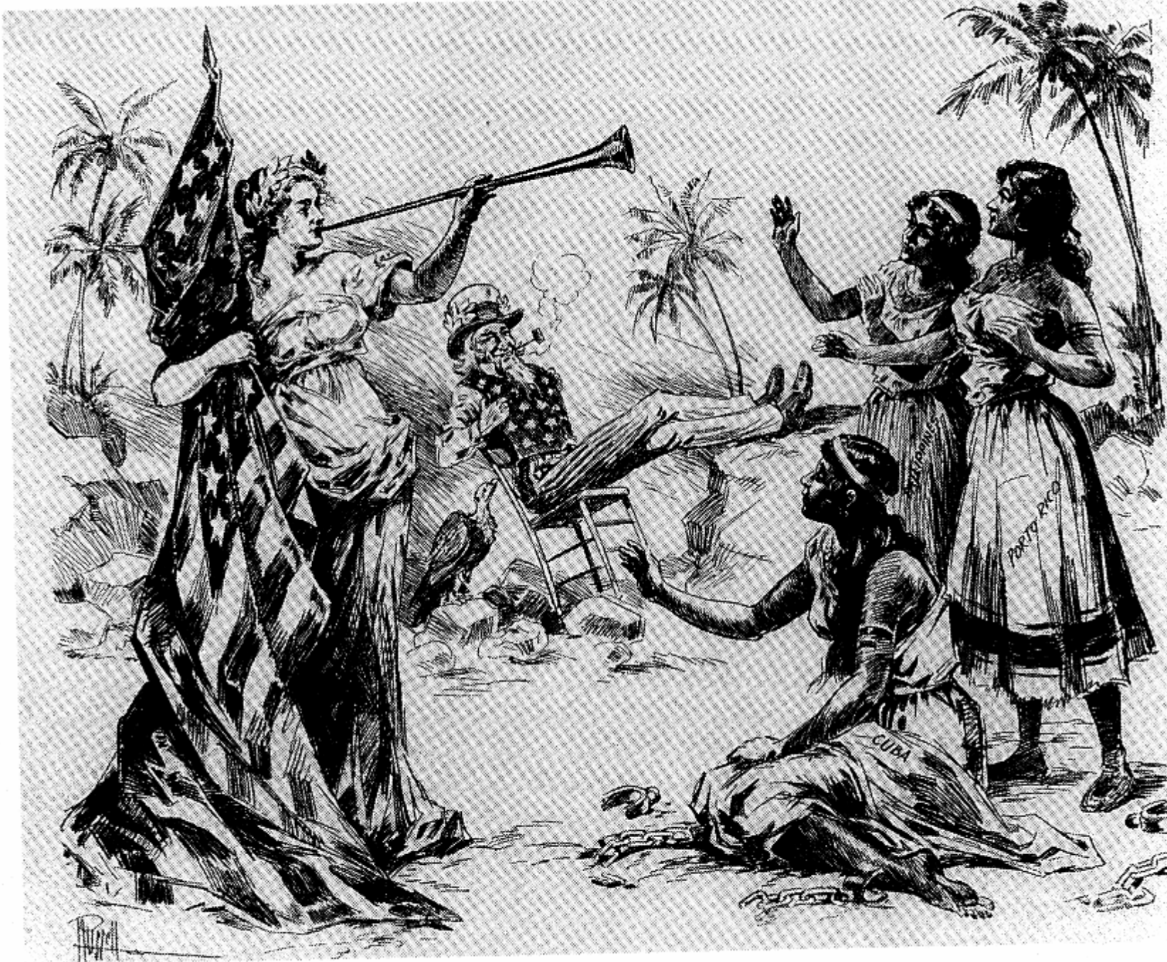
Editorial cartoon from the St. Louis Globe-Democrat , circa 1898-1899.